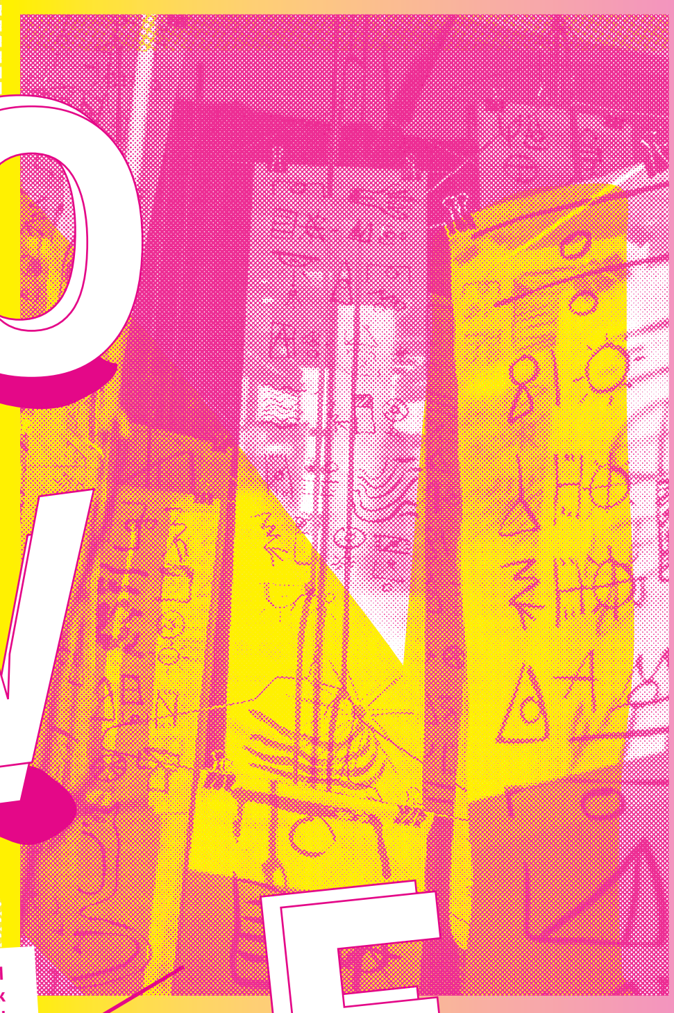
Victor F de M Torres' work at Lighthouse! a monthly multi-media showcase and journal.