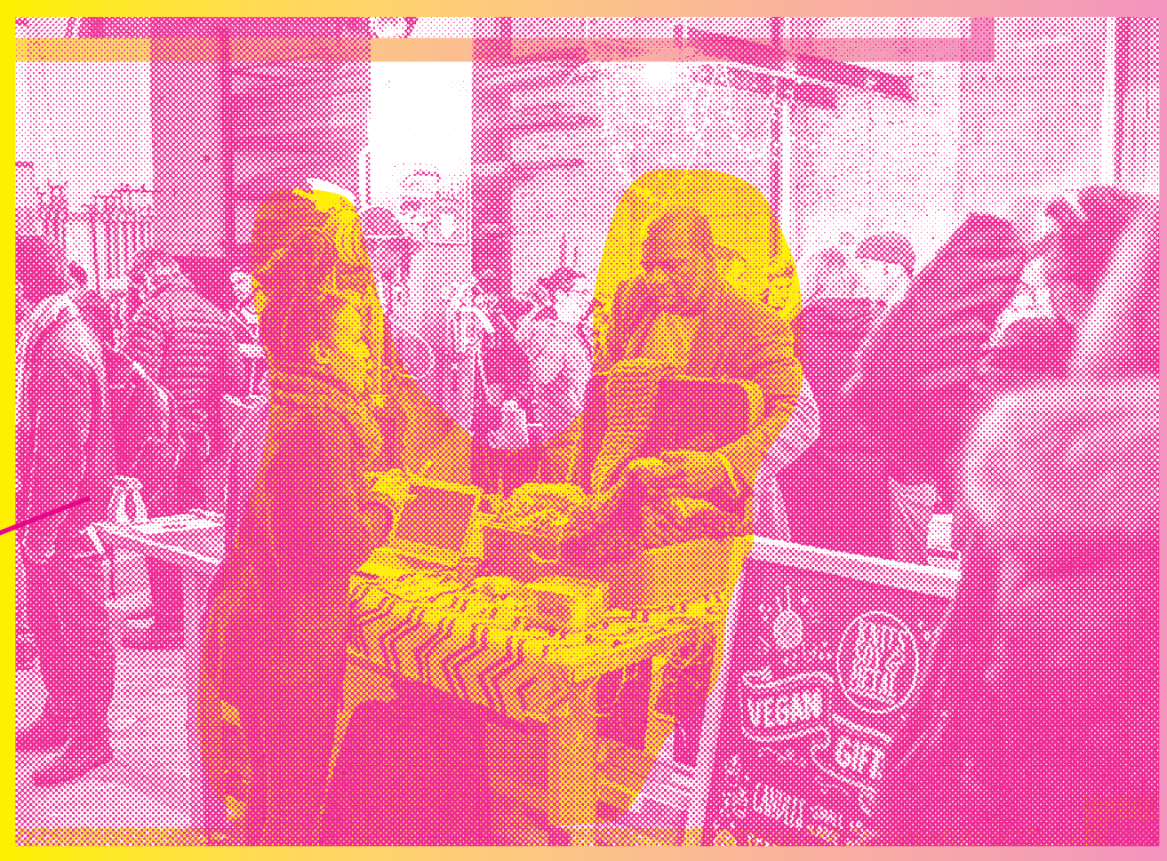
The Station North Tool Library's Happy Hour / Alloverstreet Kick Off featuring Knits, Soy and Metal and other makers at the special Women Make Baltimore, a happy hour celebrating Women's History Month.